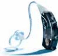
élan behind-the-ear AK-9é